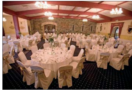
Baronial Banquet Hall