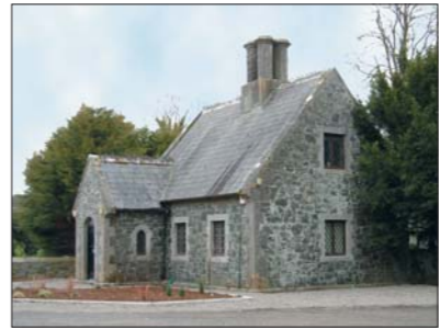
Gate Lodge 2