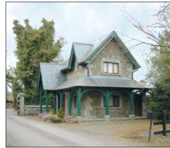
Gate Lodge 1