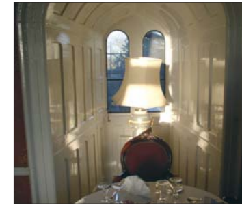
De Lacy's Period Diningroom