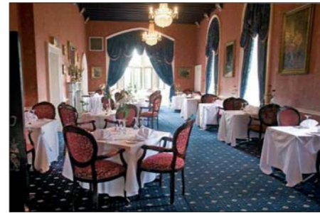
De Lacy's Period Diningroom