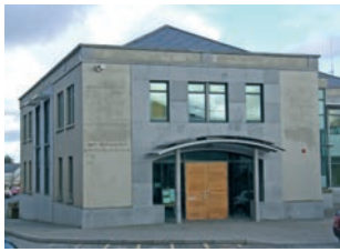
Meath Co. Co. Offices