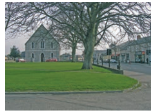
Duleek Main Street